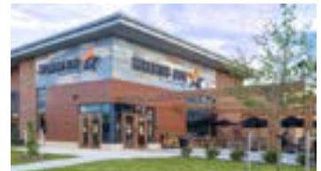
Plymouth Meeting, PA