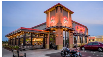
Beaver Creek, OH