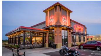
Beaver Creek, OH