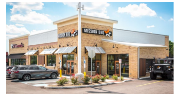
Plymouth Meeting, PA