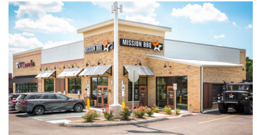
Plymouth Meeting, PA