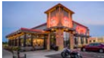
Beaver Creek, OH