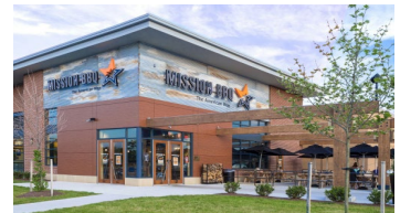
Plymouth Meeting, PA